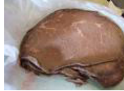
1 Pack of Beef £1.14