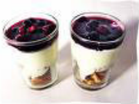
1 Bag of Frozen Fruit & 500g of Natural Yoghurt £2.78