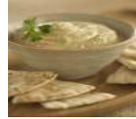
1 Tub of Humous £0.86