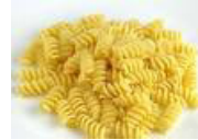
1 Bag of Pasta £0.79