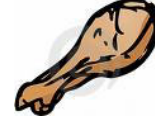
1 Pack of Cooked Chicken Drumsticks £2.20