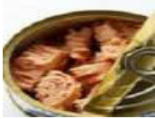
1 Tin of Salmon £0.76