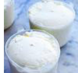
6 Pots of Fromage-frais £0.76